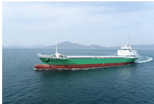
Outside appearance of vessel

Construction of the vessel is scheduled to begin from Spring 2024. If the vessel is used for substitute disaster transportation after construction, it will transport cargo that JR Freight has taken on board from each consigned forwarding business operator.